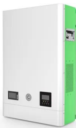
Table 4-17 Battery cabinet technical specifications Favorite Download Document ID:EDOC1100136320 Views:34013 Downloads:2363 Average rating:5.0Points